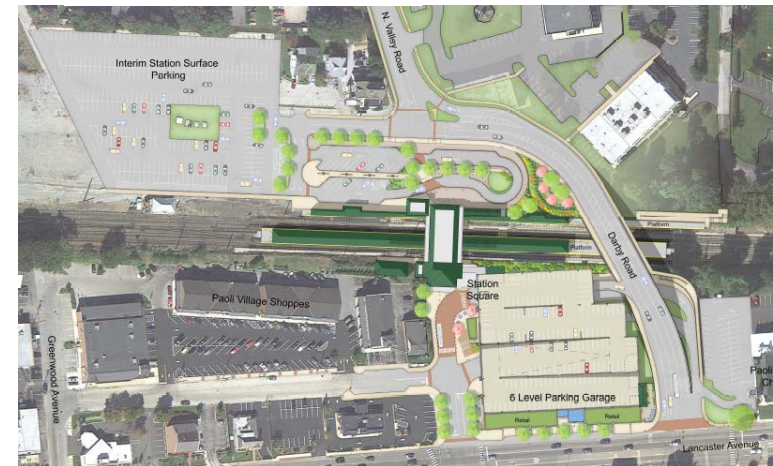
Paoli – Final Concept Plan