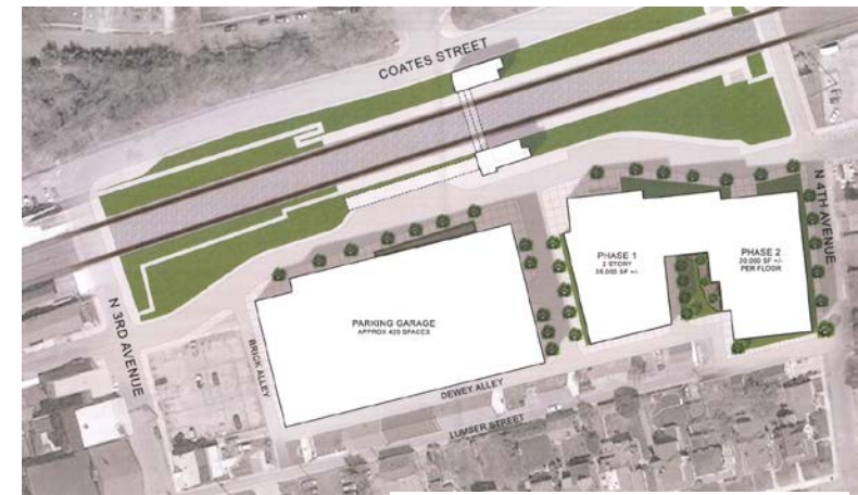
Coatesville – Final Concept Plan